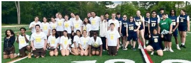
Unified Flag Football