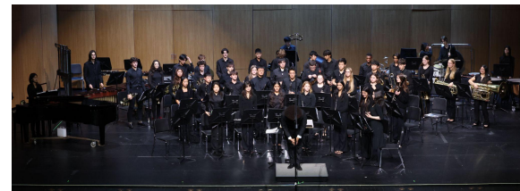
Honors Wind Ensemble Invited to NJ State Band Gala!