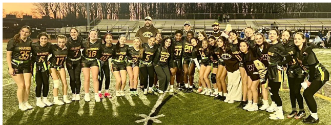
Girls Flag Football